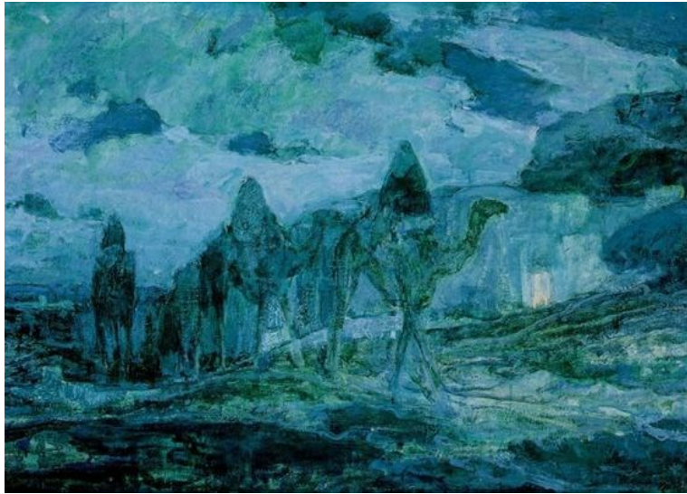
Henry Ossawa Tanner. The Three Wise Men . 1925. Private Collection.

them, the Holy Spirit came upon them, and they spoke in tongues and prophesied— altogether there were about twelve of them.