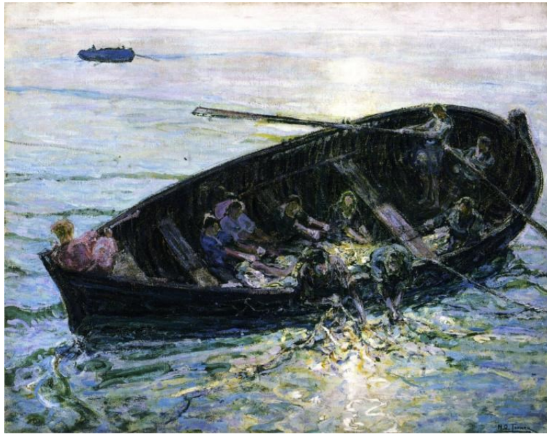
Henry Ossawa Tanner, Miraculous Haul of Fishes . 1913. National Academy Museum & School. New York, New York.

drew casting a net into the sea—for they were fishermen. And Jesus said to them, “Follow me and I will make you fish for people.” And immediately they left their nets and followed him. As he went a little farther, he saw James son of Zebedee and his brother John, who were in their boat mending the nets. Immediately he called them; and they left their father Zebedee in the boat with the hired men, and followed him.