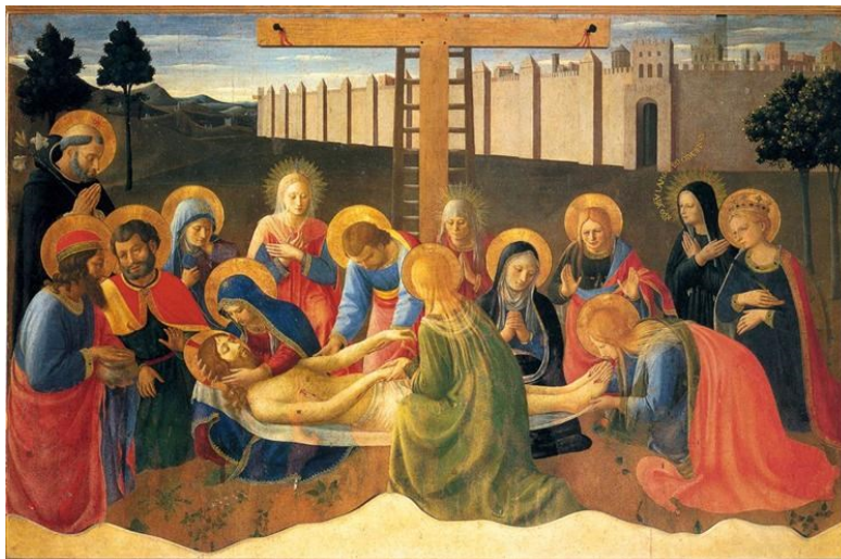
Fra Angelico. Lamentation over Christ . 1436-1441 Basilica di San Marco, Florence, Italy

For I know that my Redeemer lives, and that at the last he will stand upon the earth; and after my skin has been thus destroyed, then in my flesh I shall see God, whom I shall see on my side, and my eyes shall behold, and not another.